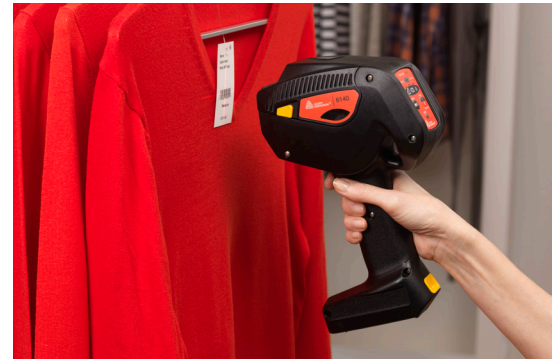
Markdown accuracy percentage per markdown device Internal study using 500 scanned garments

"When the associates start doing markdowns, it's not unusual for customers to walk in the door," Blancato said. "These are commissioned sales reps and they'd much rather sell and get paid than to actually go and do markdowns. The old method they were using was very inaccurate and they weren't getting them done. When they're not getting done, they're not selling and that's a problem."