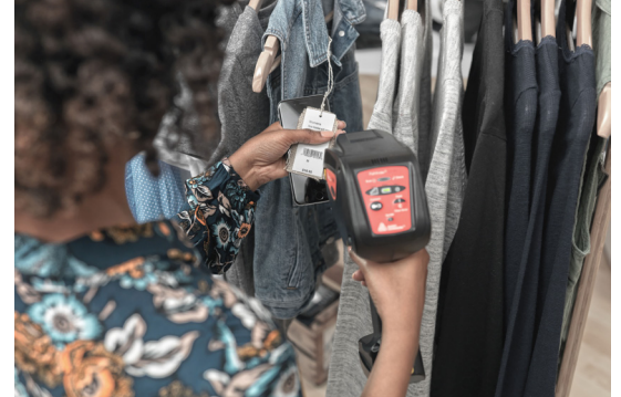
Markdown accuracy percentage per markdown device Internal study using 500 scanned garments

While it is too early in the process to fully gauge the impact of using the Pathfinder 6140 in all 140 locations, there is a favorable projected return on investment. An ROI calculator showed anticipated savings of $489,000 a year with a payback estimated at six-and-a-half months. Those results prompted the customer to explore other possible applications for the 6140 such as using it for inventory or in their warehouse.