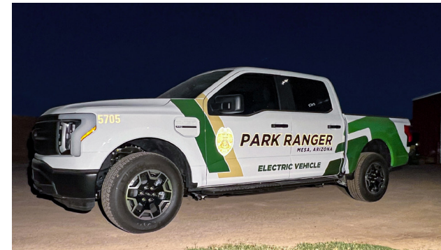
This Mesa, AZ park ranger vehicle is a partial wrap featuring V4000 Reflective Film and PVC Free DOL 6460 Gloss and MPI 1105.