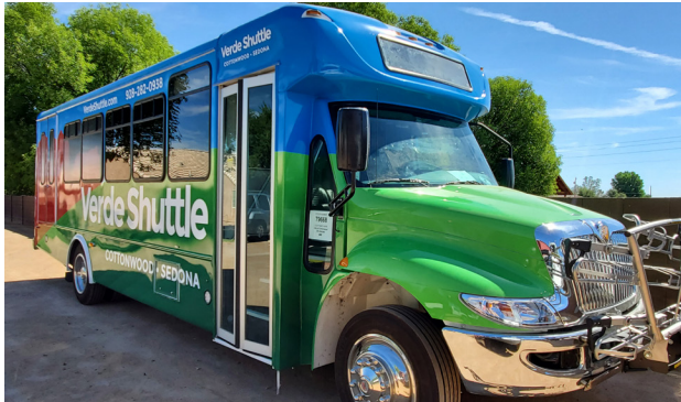
Pictured here is MPI 1105 full bus wrap with DOL 6460 PVC Free and SC950 Cut Vinyl lettering.

This supercast film can be applied in a variety of ways, including fleet and consumer vehicles, for maximum brand and personal expression. From gas pumps to mobile billboards, from corporate signage to highly contoured applications with tight recesses, this product delivers superior performance and ease of use. This formulation delivers exceptional print and ink robustness across all digital platforms, including latex technology.